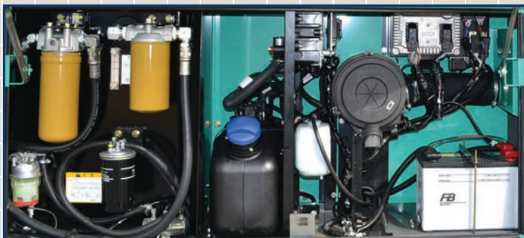
Easily accessible filters, DEF tank and battery