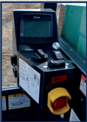
Multifunction monitor shows fuel, DEF tank, rpm, and voltage